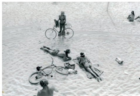
Tod Papageorge, California Beach , from the series At the Beach , 1978, © Tod Papageorge, courtesy Galerie Thomas Zander, Cologne