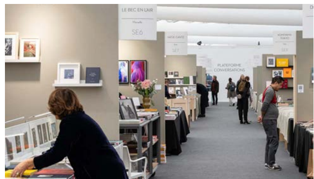
Paris Photo 2022 - Edition