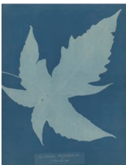
Anna Atkins, Aspidium Trifoliatum (Jamaica), circa 1851-1854