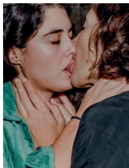
Myriam Boulos, Beirut, Lebanon , 2019, © and courtesy Myriam Boulos/Magnum Photos