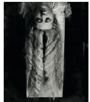
Man Ray, Woman with Long Hair, 1930